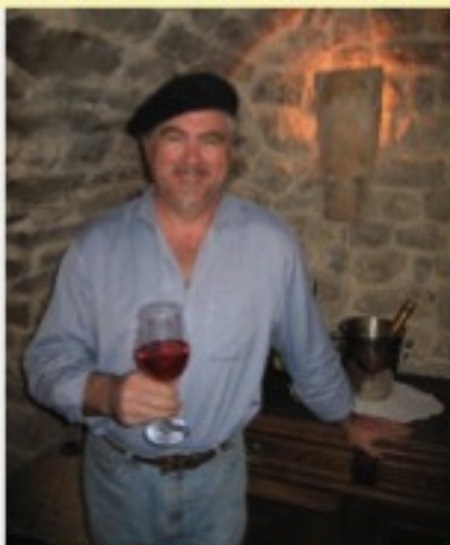
In the future tasting room at Monte Lauro Vineyards

We are here...in the Languedoc, the "wine barrel" of the world