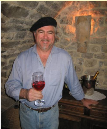
In the future tasting room at Monte Lauro Vineyards

We are here...in the Languedoc, the "wine barrel" of the world